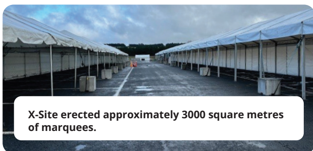
X-Site erected approximately 3000 square metres of marquees.

Shanelle mentioned that the X-Site team worked well onsite and offered assistance outside of their contractual obligations, “we worked well as a team onsite and they even