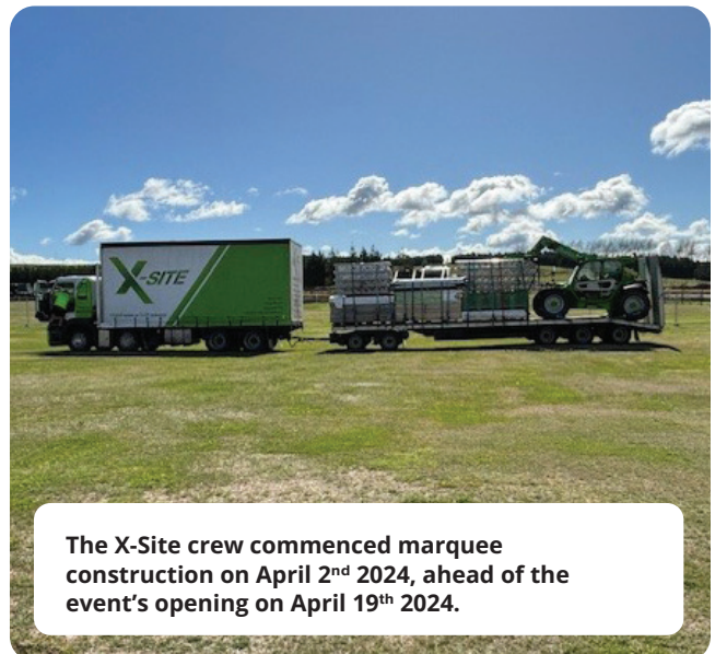
The X-Site crew commenced marquee construction on April 2 nd 2024, ahead of the event's opening on April 19 th 2024.