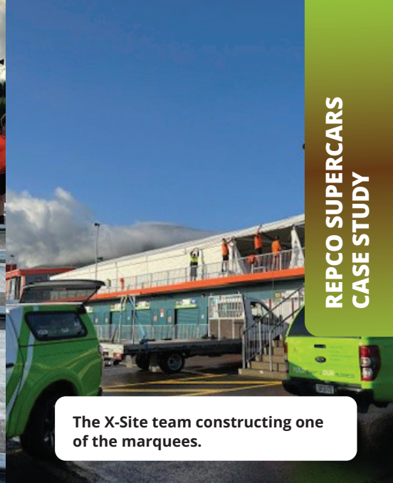
The X-Site team constructing one of the marquees.